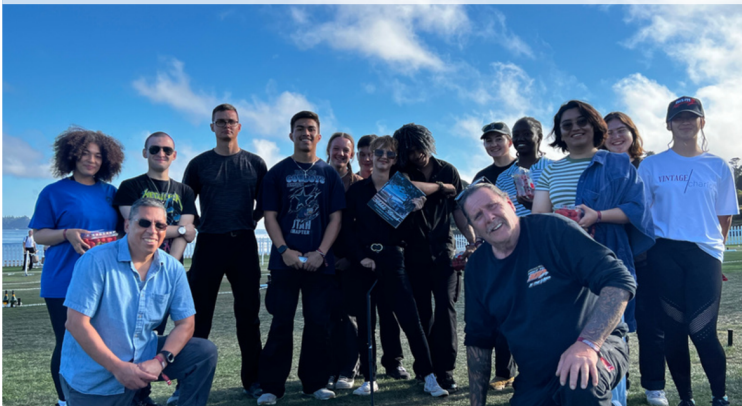
Pictured are volunteers from VTC and DLI at the Pebble Beach Concourse D'Elegance on Sunday, August 18th.